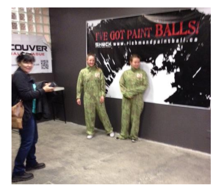
The Australian Chaperone checking out her team.