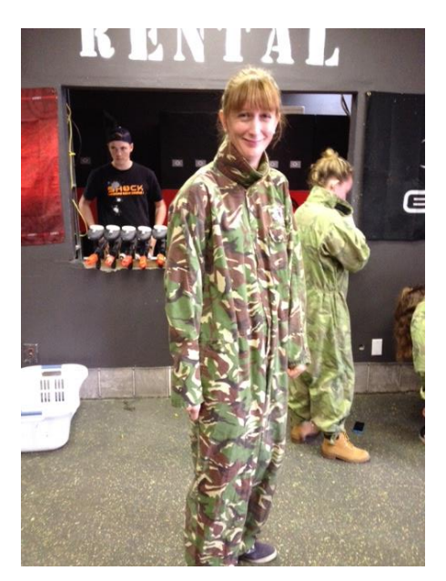
The British Chaperone – quite a fashion statement!