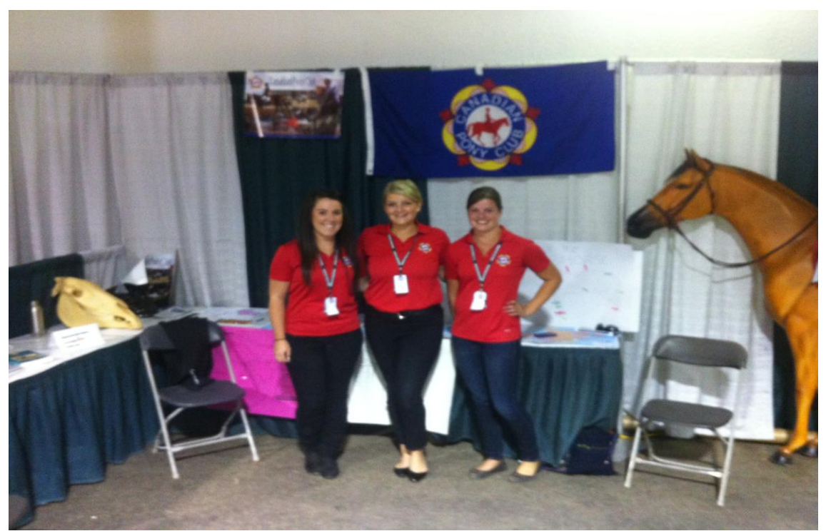
Green Hawk sponsored us with a saddle pad that was signed by the Canadian Olympic Team. We got a box and had a raffle for it. (We used the pad as a way to lure people into our booth)