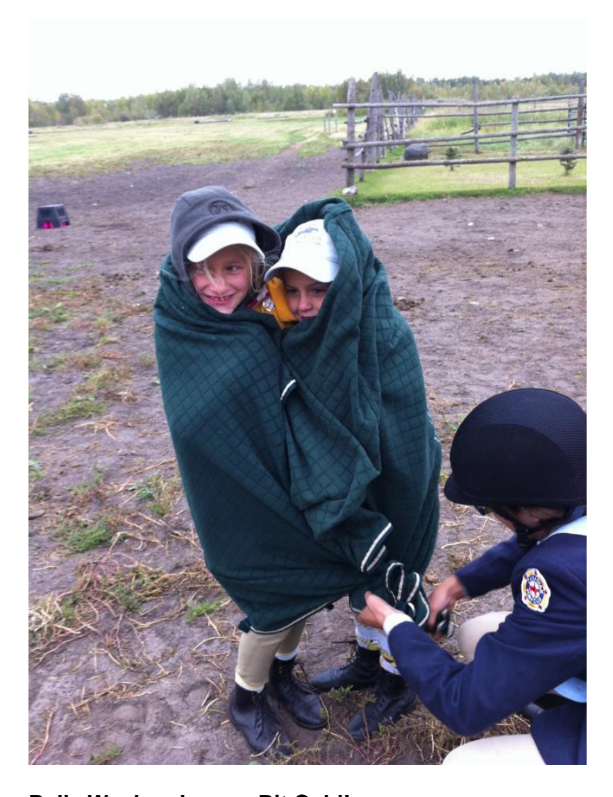
Rally Weekend was a Bit Cold!

Many thanks to our hosts, volunteers, cooks, ground jury and judges who helped to ensure a successful, fun-filled weekend was had by all!