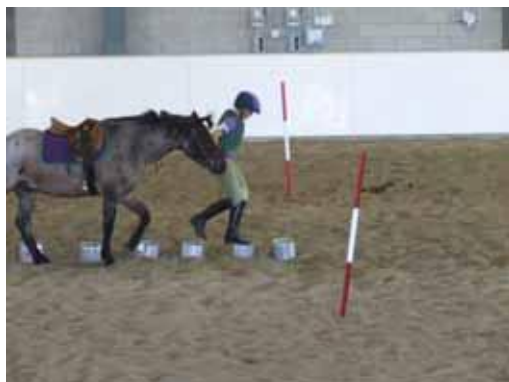
Micky Collins and Chocolate Chipper tackle the stepping stones.

The Centre, located in Clinton, Ontario, includes an Olympic-sized indoor arena, warm-up arena, two oversized outdoor show rings, facilities for show stabling and RV parking, and is also home to a full educational facility with classrooms, dorm rooms and a community kitchen.