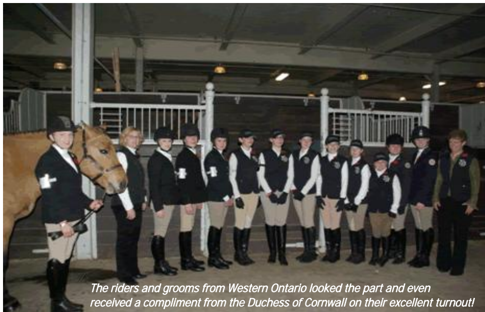
The riders and grooms from Western Ontario looked the part and even received a compliment from the Duchess of Cornwall on their excellent turnout!