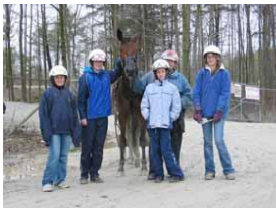
Guelph Pony Club visits Mohawk Racetrack for a senior education session. Senior members got to ride a buggy themselves, with some of the top racers in Ontario.