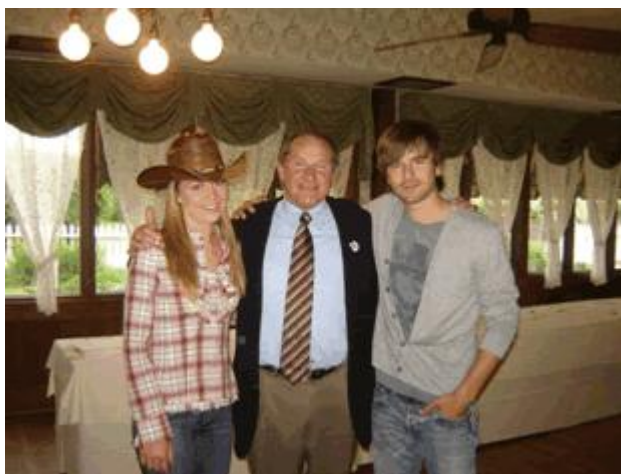
Watch "Heartland" on CBC TV Sundays starring Amy and Tyler. Special guest appearance here by Del.