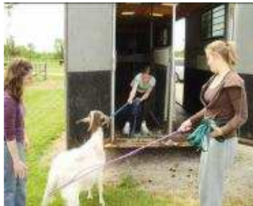
Creative learning at its best. Notice anything strange about this picture?